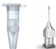
Suction needle in protective cartridge