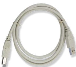
Data lead USB 2.0 Approx. 1 m long