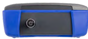
Underside of handheld device: tube connection

AtmoCheck® and its included accessories are supplied in an attractive hard cover case for safe transport, with all parts ready for immediate use.