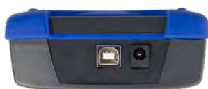
Top side of handheld device: USB Port and charger